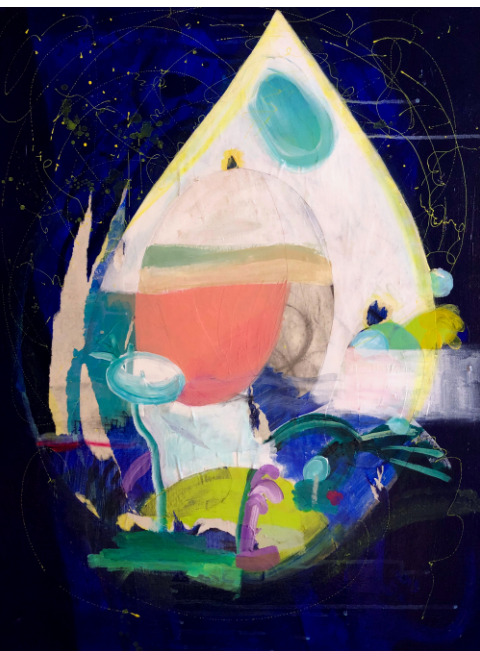
Glowing and Growing Home, Soo Hong, 2019 GAP